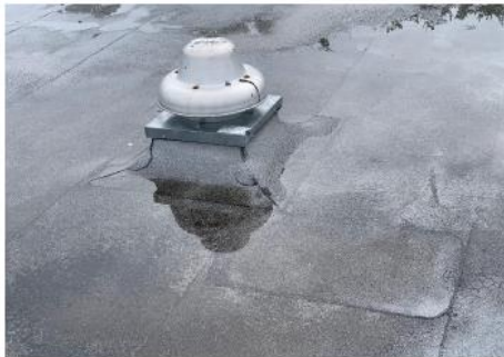
EF CURB SUBMERGED IN WATER