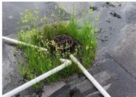
VEGETATION FORMING IN AND AROUND ROOF DRAIN