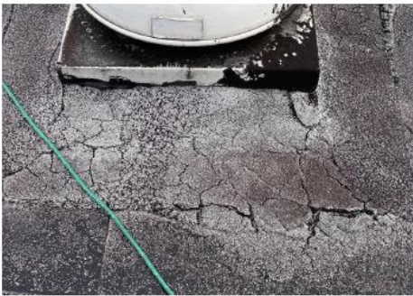
FAILING CURB FLASHING