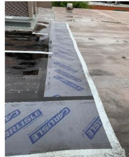
REPAIR MADE USING WIP ICE AND WATER SHIELD - THIS IS NOT COMPATIBLE OR DESIGNED FOR LOW SLOPE ROOF APPLICATIONS