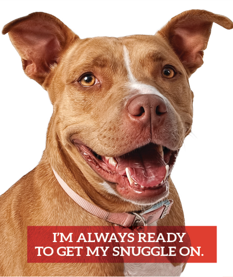
I'M ALWAYS READY TO GET MY SNUGGLE ON.