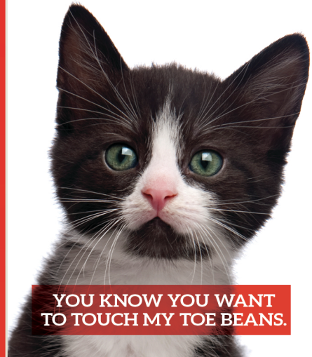
YOU KNOW YOU WANT TO TOUCH MY TOE BEANS.