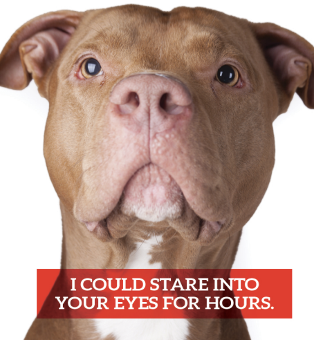
I COULD STARE INTO YOUR EYES FOR HOURS.