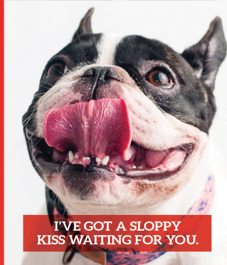
I'VE GOT A SLOPPY KISS WAITING FOR YOU.