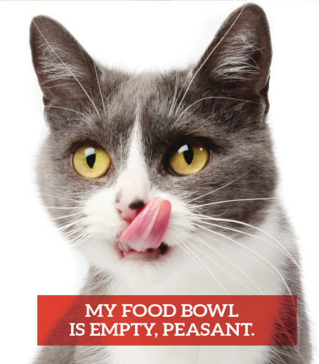
MY FOOD BOWL IS EMPTY, PEASANT.