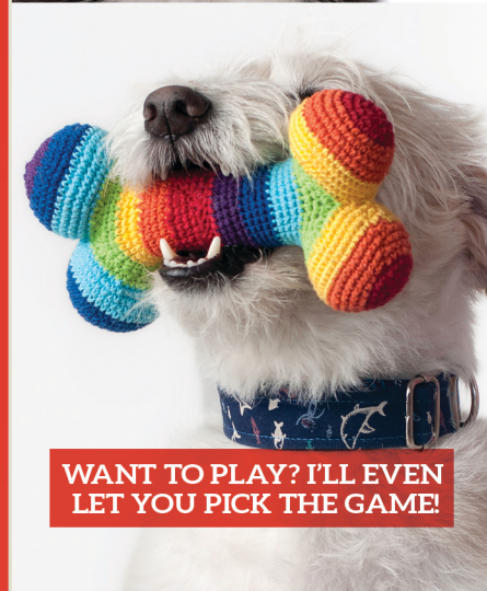
WANT TO PLAY? I'LL EVEN LET YOU PICK THE GAME!