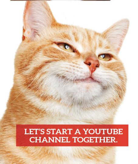
LET'S START A YOUTUBE CHANNEL TOGETHER.